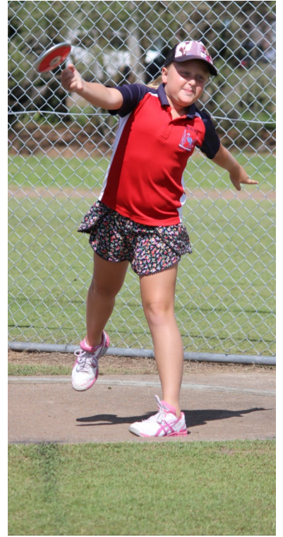
2015 Athletics Carnival