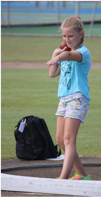
Thank you to everyone who made the day possible and successful