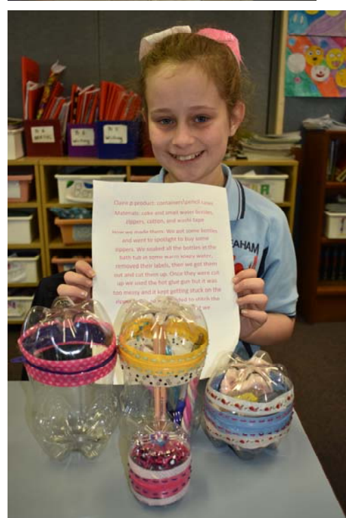
Year 5/6 Recycling Projects