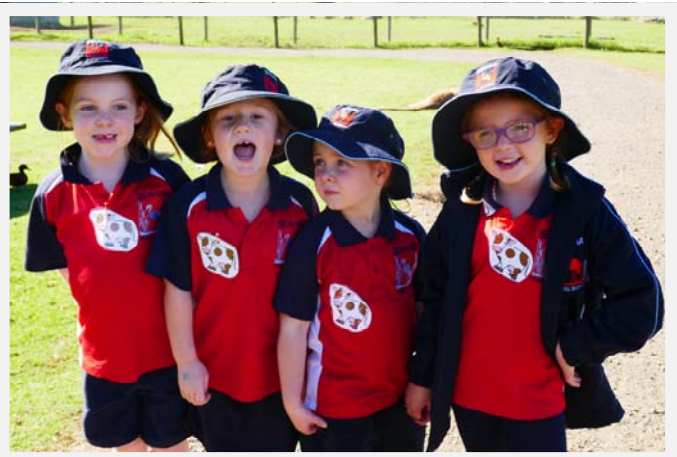
Kids meeting Kids!