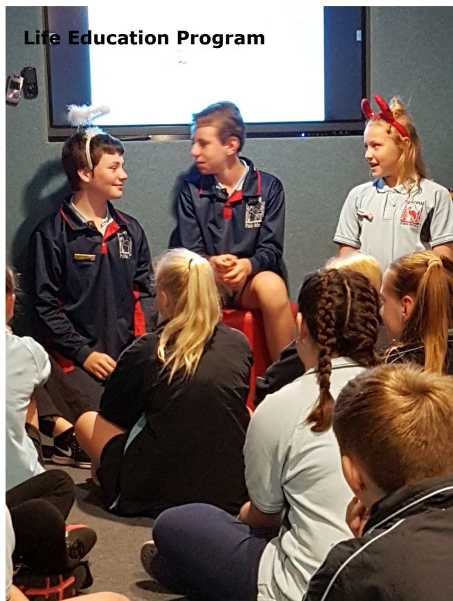
Life Education Program

Healthy Harold: Our Life Education Program is over for another two years. Life Education exists to empower children and young people to make safer and healthier choices through education.