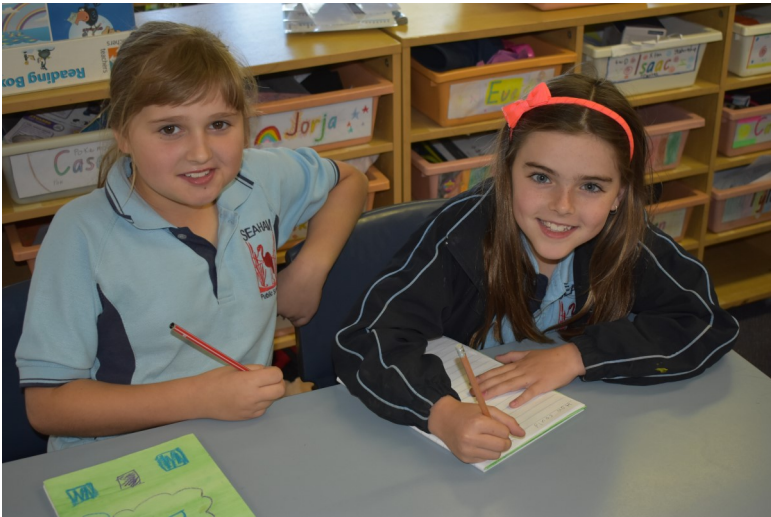
3/4A: Some photos of 3/4A enjoying their learning